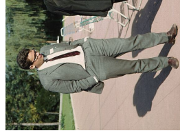
P. Brinch Hansen