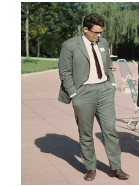
P. Brinch Hansen