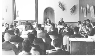
D. McIlroy "Mass-produced Software Components"