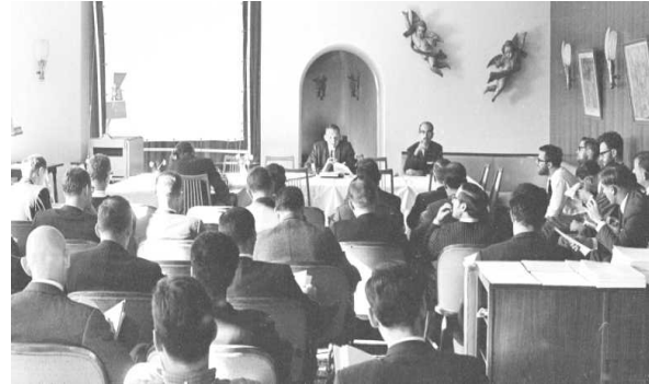
D. McIlroy "Mass-produced Software Components"