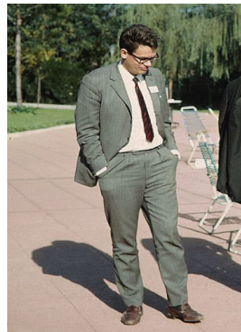
P. Brinch Hansen